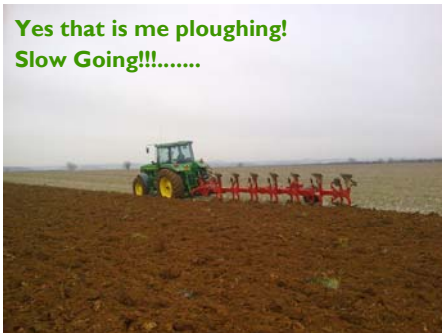
Yes that is me ploughing! Slow Going!!!.....