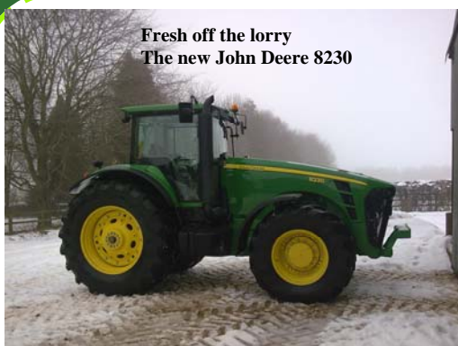
Fresh off the lorry The new John Deere 8230

It was a cold rainy day but seeing this arrive on the lorry made it a little better.